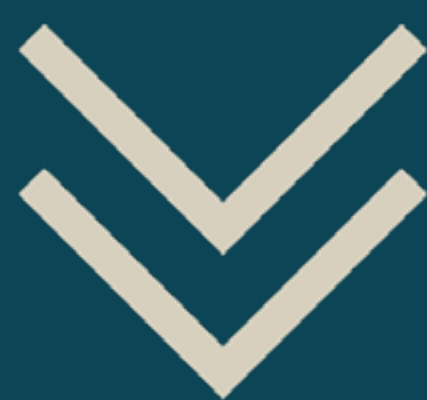
Chart Your Path to a Preferred Future